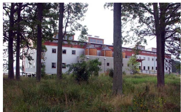
Figure 2. Phillip Merrill Environment Centre: Designed integration of water systems

In relation to SPE site design indicators that relate to access to sustainable transport, the protection or improvement of ecological value, appropriateness of density and sustainable drainage: these were found to relate to ADE themes of Brief, Health, Transport, Context and Performance indicators in terms of: delivering a realistic brief in relation to the site; Health, that the development promotes health communities; Transport, that the development opens up options for moving through the wider area, makes a positive